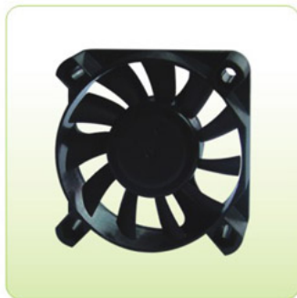
BRUSHLESS FAN 50 × 50 × 10mm

寿命 Life Expectancy at 40 : Ball bearing 50000 hours Sleeve bearing 30000 hours