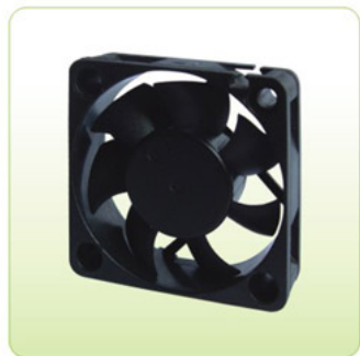
BRUSHLESS FAN 50 × 50 × 15mm

寿命 Life Expectancy at 40 :Ball bearing 50000 hours Sleeve bearing 30000 hours