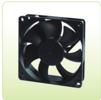
BRUSHLESS FAN 80 × 80 × 25mm

寿命 Life Expectancy at 40 : Ball bearing 50000 hours Sleeve bearing 30000 hours